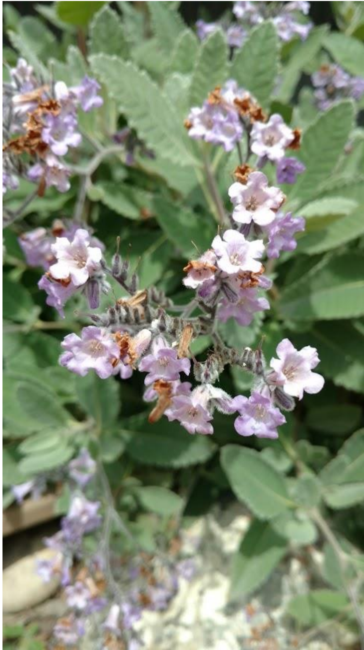
Yerba Santa ( Eriodictyon crassifolium) at ENC Butterfly House.