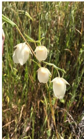
Fairy lanterns ( Calochortus albus ).