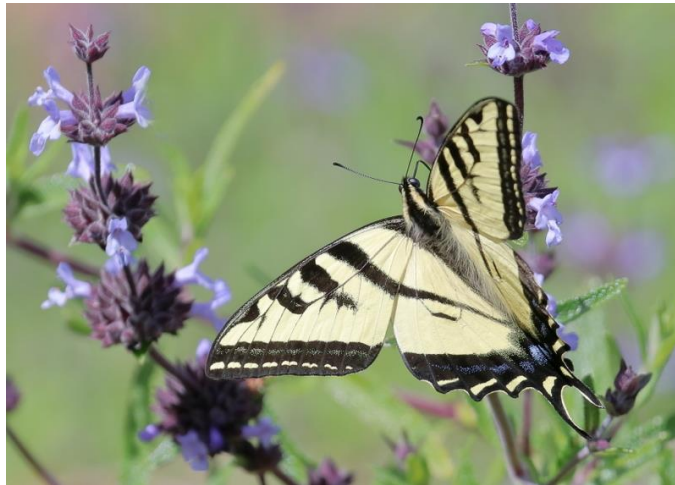
Swallowtail on sage ( Salvia sp.) at RSABG.

Near the main entrance to Rancho Santa Ana Botanic Garden in Claremont is a stand of Matilija poppies ( Romneya coulteri ) welcoming visitors and waving their large white flowers. Throughout the garden colorful monkey flowers ( Diplacus sp. and cultivars) are blooming showing reds, yellows, oranges, pinks and white colors. Showy penstemon ( Penstemon spectabilis ) is outrageous dressed in its neon-like purple-blue color. In the desert section, the cacti are starting to flower nicely, There is beavertail cactus, hedgehog cactus, grizzleybear prickley pear cactus and Mojave mound cactus blooming red, yellow, and pink, under the regal watch of the blooming white flowering Chaparral Yucca,